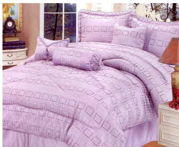
Squares Bedding from Luxury Home Textile, Inc.

Luxury Home Textile's latest products include the Paris Window Panels and the Woven Stripe Window Panels (shown above), made from 100% polyester. Offering a subtle yet contemporary look to any room, the Woven Stripe window panels consist of stripes in soft earth tones. The Squares Bedding Collection shown below is also new and is made up of geometric squares against a soft lilac background. It is a seven piece set consisting of a comforter, two pillow shams, one bed skirt and three