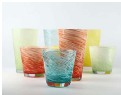
Colored Glass Collection at Circle Glass

Since its beginnings in 1982, Circle Glass has been distributing glassware and has successfully grown into a multi-million dollar business servicing major American and international retailers in private label goods as well as its own Circle brand.