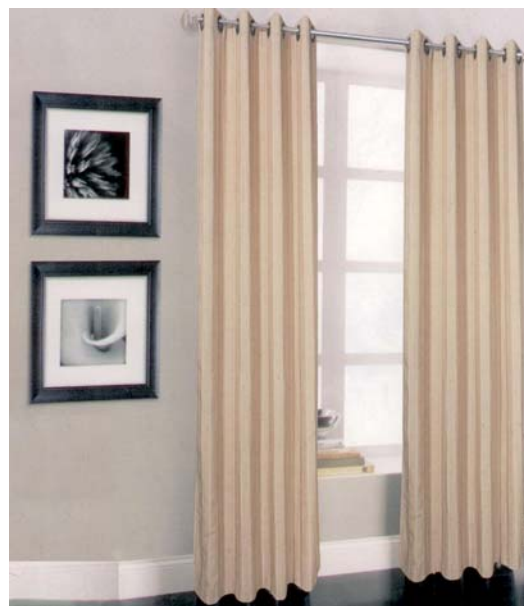
Woven Stripe Window Panels from Luxury Home Textile, Inc.