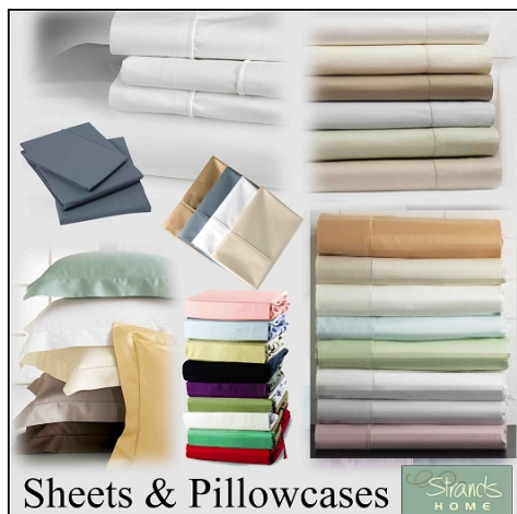
Wrinkle Resistant Sheets from Strands Home

Strands Textile Mills unveiled their Suite 417 showroom in March for the NY Home Fashions Market. Strands Textile Mills had its beginnings 25 years ago in India producing down proof products like pillow and featherbed shells as well as comforters. It gradually expanded into a vertical integrated unit with weaving, warping, sizing, processing, stitching, packaging and factory stuffed containers. These containers are shipped to the U.S. with an 18 day lead time to the east coast and a 25 day lead time to the west coast.